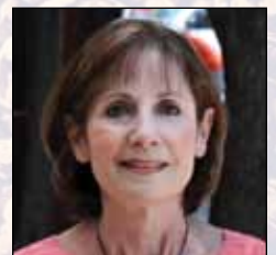
Trial of Her Life