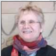
Two Countries Grappling With Immigration Policy By JUDITH BERNSTEIN-BAKER